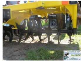
AWMP-075-AG-4 Salford AerWay, 45-75HP Tractor with hydraulics recommended. Cultivation width 7.5', Weight 2150 lbs.

No-Till Seeder & Rental Terms Grafton County