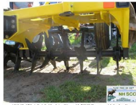
AWMF-075-AG-4 Salford AerWay. 45-75HP Tractor with hydraulics recommended. Cultivation width 7.5'. Weight 2150 lbs.

No-Til Seeder & Rental Terms Grafton County