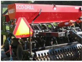
The KED-72 is 6' wide and capable of planting 3 rows, with 8" spacing. KASCO recommends a 25hp+ tractor, with sufficient lift capacity to handle approximately 1600 lbs. on back.

No-Til Seeder & Rental Terms Grafton County